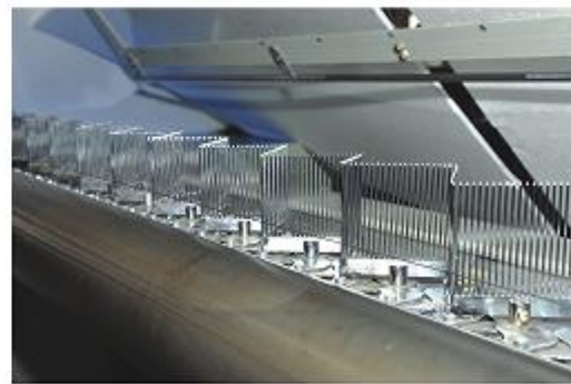
伸缩筘 Expansion Reed