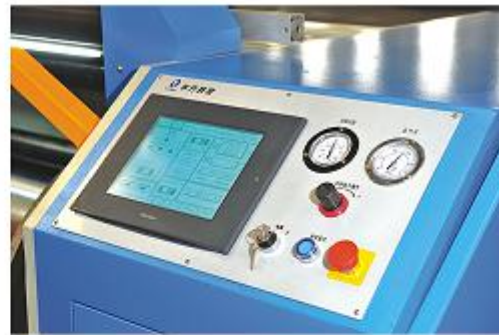
主控操作面板 Main Operation Touch Screen