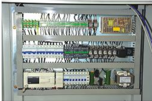
电器控制系统 Electric Control System