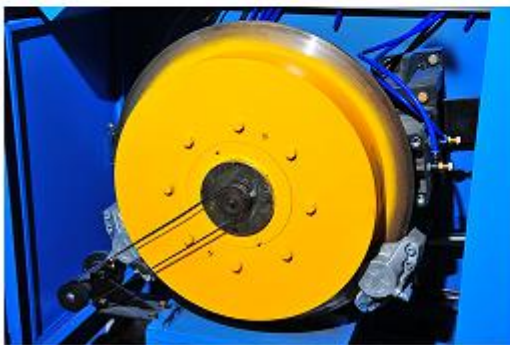
制动结构 Brake Mechanism